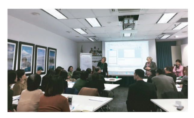
Workshop on International Skills Traning (IST) Courses for Trainers and Assessors - 30 January 2018

Among others human resource development priorities of the Government of Vietnam, the pressing need to upskill a large number of VET trainers and assessors present tremendous opportunities which International Skills Training (IST)-licensed providers may want to consider.