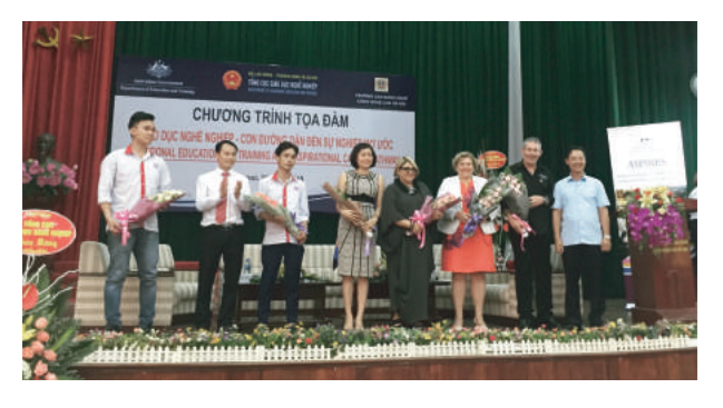
An ASPIRES event with Australian Vocational Education and Training experts and alumni