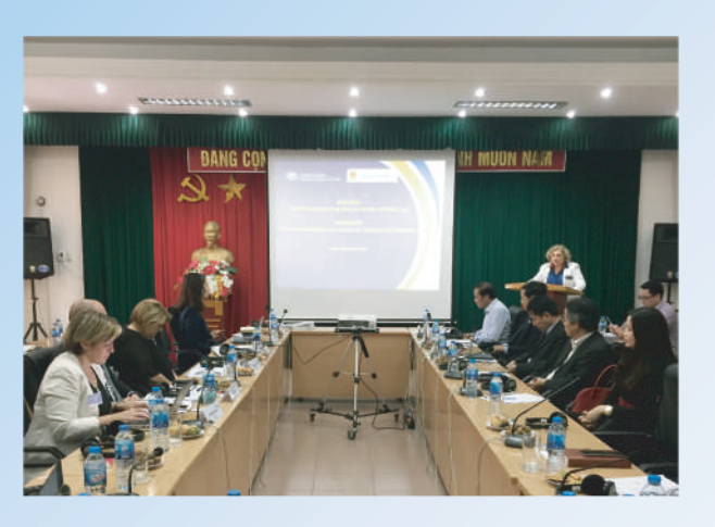
Workshop on Industry Consultative Mechanism in Tourism and Hospitality co-organised by DET and DVET - 23 March 2018