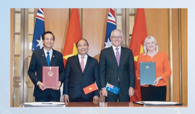
The signing of the MOU on Vocational Education and Training - 15 March 2018

In March 2018, Assistant Minister for Vocational Education and Skills the Hon. Karen Andrews MP, signed a Memorandum of Understanding on vocational education and training with Minister Dao Ngoc Dung from the Ministry of Labour, Invalids and Social Affairs. The MoU identifies four priority areas of cooperation - policy and governance, quality personnel, institutional collaboration, and mobility. Although a detailed Plan of Action is not yet finalised, the Australian government has been working closely with DVET-MOLISA to further progress the MoU.